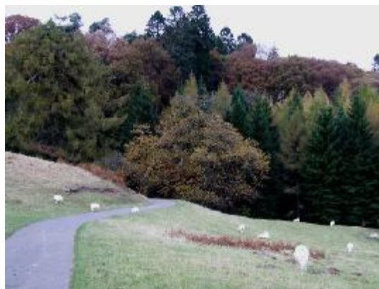
Brown Clee Hill staged two National Events in the 1980s

The most prestigious events staged by HOC in this period were National Events in 1982 and 1987, both on Brown Clee Hill and the British Championships of 1985 in the Wyre Forest (the last time the main forest was made available for high volume orienteering). SinS was started in 1983. Initially a two day event centred on the early May bank holiday weekend, it expanded to three days and switched to its regular slot in late May two years later with considerable success.