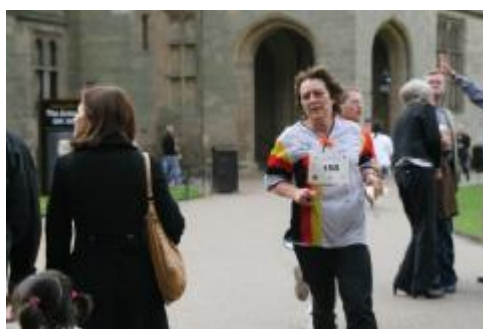
Taking the sport to a (bemused) public: Warwick Town races 2007