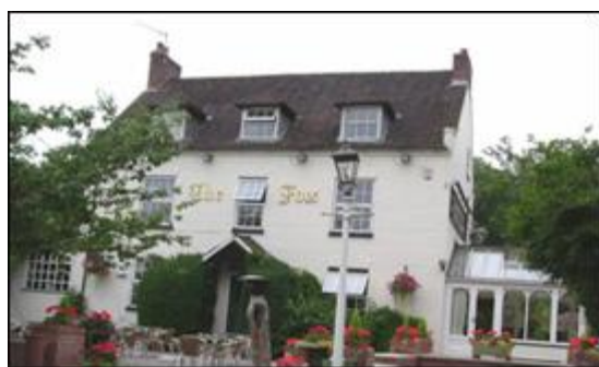
The Fox at Stourton was the venue for many club dinners including the tenth anniversary event (and will also hold the forthcoming 40 th anniversary dinner)

On the domestic scene, the appearance of Ned Paul's Compass Sport magazine in 1980 was significant, not the least for its eventual bringing about of the demise of the by-then woeful "Orienteer", but also for the introduction of the Compass Sport Cup in 1983. This era also saw the introduction of Colour Coded courses at the beginning of the 1980s, allowing greater consistency at Club (now District) events. National Events replaced and expanded the old Regional Championship structure, although the regional championships survived, incorporated into lower standard events. Sponsorship fluctuated wildly (e.g. Rank Xerox, Paper Sacks, Peter Dominic) and computers began to be used for calculating and compiling